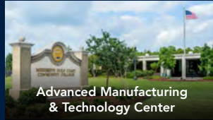
Advanced Manufacturing & Technology Center