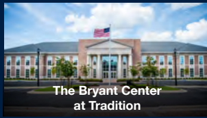
The Bryant Center at Tradition