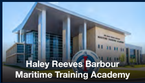
Haley Reeves Barbour Maritime Training Academy

Sablich Center, Room 219 500 Fisher Street, Biloxi, MS 39534