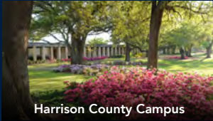
Harrison County Campus