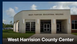
West Harrison County Center

1000 Jerry Saint Pé Hwy. Pascagoula, MS 39568