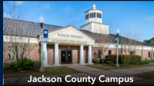
Jackson County Campus