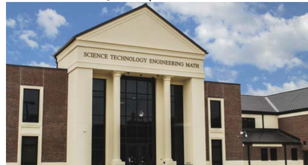
STEM Building, Jackson County Campus