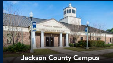
Jackson County Campus