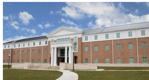
New Residence Hall, Perkinston Campus