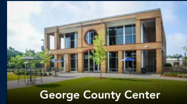
George County Center