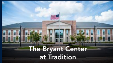
The Bryant Center at Tradition