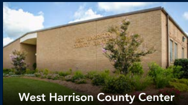
West Harrison County Center

Moreell Building, Building 60, Room 227 1800 Dong Xoai Ave., Gulfport, MS 39503