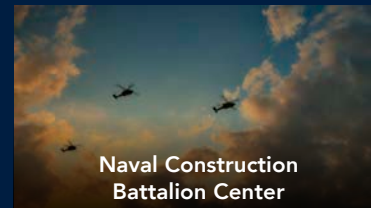
Naval Construction Battalion Center

Moreell Building, Building 60, Room 227 1800 Dong Xoai Ave., Gulfport, MS 39503