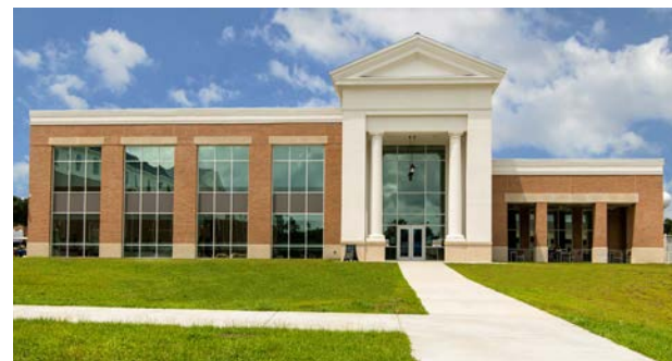
Student Union/Cafeteria, Perkinston Campus