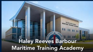
Haley Reeves Barbour Maritime Training Academy

1000 Jerry St. Pe' Hwy. Pascagoula, MS 39568