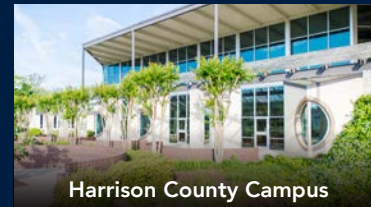
Harrison County Campus