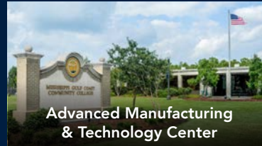
Advanced Manufacturing & Technology Center