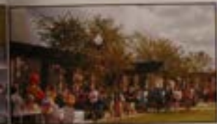
Students enjoying the start of Daybreak.