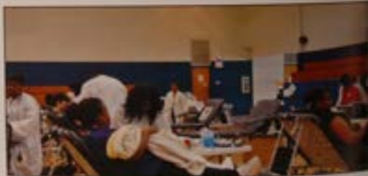
20 students making a difference at the Spring 2013 Blood Drive.