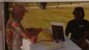
Students enjoy the Daybreak activities and a presentation for a 27th birthday.