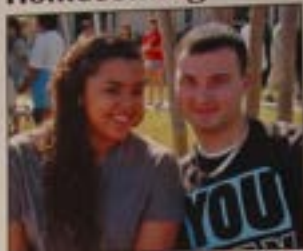
Students enjoying the festivities at the 51 Homecoming Flag Rally.