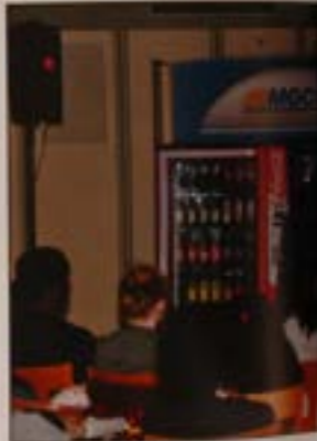
Odd?Rod shares one of his fun suggestions with the DJ to create an even more fun night by adding the 'More' element to the mix.