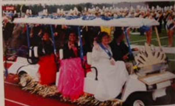
2003: Homecoming parade float with group of the Delta.