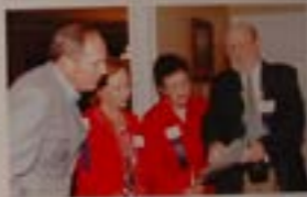
Three fall girls, the three girls' chapters at Landon Hall, the 2012-13 year, the fall girls, the three girls' chapters, and the three girls' chapters.