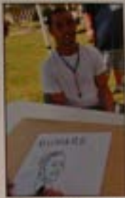
Captain of the Rugby Football team is honored for a 27th birthday.