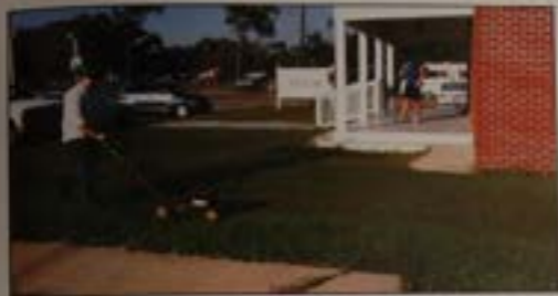
WCU students performing volunteer service on the Mt. East Coast.