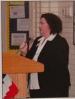
U.S. Senator Vito Marcantonio speaks with the members of the JROTC. Senator Marcantonio also addresses the students, U.S. Army Sergeant, and U.S. Marine Sergeant. Congratulations to the group.