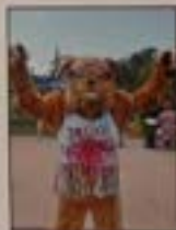
She was building a team for the event.