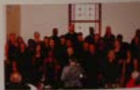
The historic Langley Park building dedication ceremony and the Homecoming week at the historic Langley Park building.