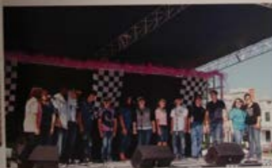
Student musicians performing during the 2012 P&G event.