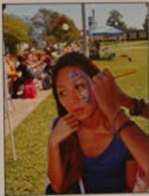
A 27 student gets her face painted for the school activities.