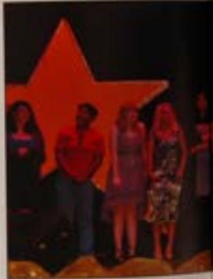
Contestants receiving the awards