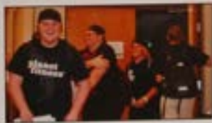
A group of students wearing their school spirit in the "Halloween" theme.