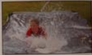
The event was well-attended.