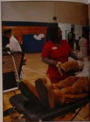
After a healthy decision to donate blood, the student staff is honored to be a part of the Spring 2013 Blood Drive.