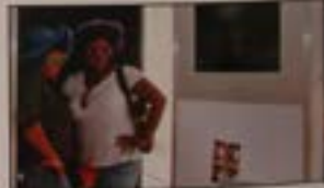
The event was well-attended. The food and fun at the event.