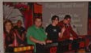
Thousands cheer their game on during the Think Fast Game Show.