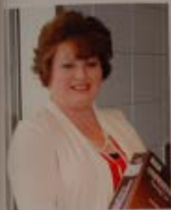
Jenna L. Coleman