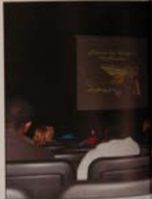
Each 90-minute session is presented to the 90 students with the high-resolution screen, providing a high-quality presentation.