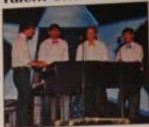
3rd Place - The Beebe Boys