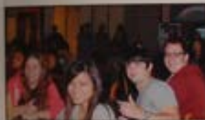
Thousands cheer in amazement with dreams of being the richest man/woman in the house.