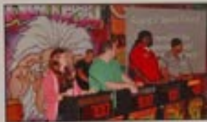
The Think Fast Game Show allows you to cash in on the dreams of being rich and famous.