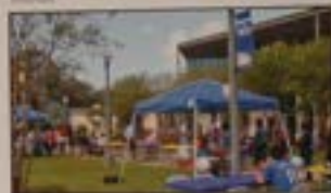
It was a busy and well-attended. The food and fun at the event.