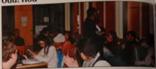
Odd?Rod walks through the crowd to add a personal connection to the event.