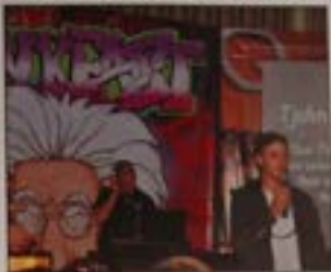
Highlighting some amazing money you can win at the Think Fast Game Show.