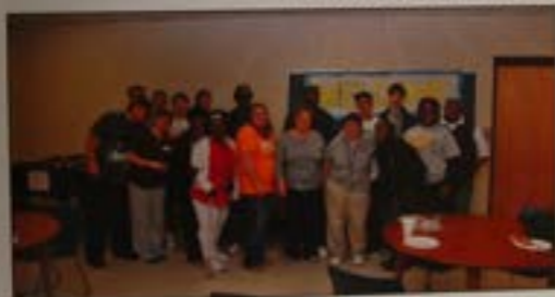
Members of the Wesley Student Organization meet every Tuesday for lunch and fellowship.