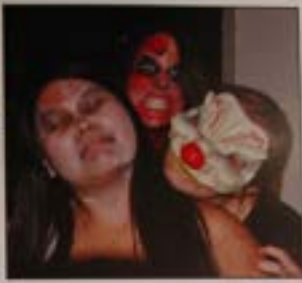
Students in costumes made for students in the spirit of the school and community in the "Halloween" theme.