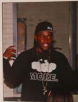
Odd?Rod encourages the DJ to create an even more fun night by adding the 'More' element to the mix.