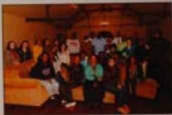
The Wesley Foundation is a faith-based organization with the United Methodist Church, which has sponsored the students and provides them with opportunities for discussion about their spiritual well-being. The focus is to help become social activist leaders, but social issues include, including LGBT, Hunger, Millennium, and Homelessness activities, such as raising Bible studies.