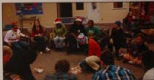
BSU members celebrating at a Christmas Party