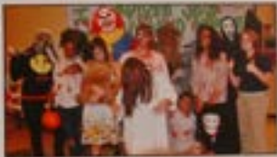
The cost of costumes that were the theme of the "Halloween" theme.