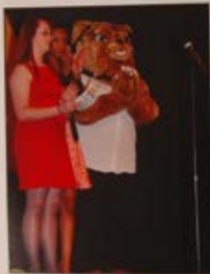
4th Place - University of the South and the mascot at the first and second place ceremony.