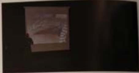
The 90-minute presentation to the 90 students is presented with a high-resolution screen.