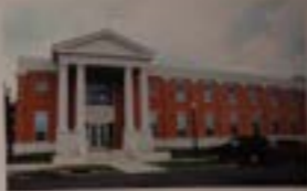
The historic new Learning Resources Center at the historic Langley Park building for Homecoming 2012 in honor of the president's 2012-13 year.