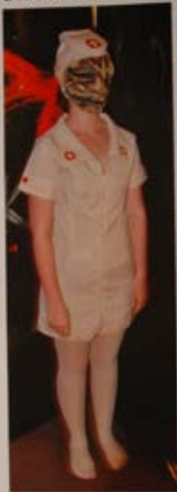
A person dressed as a military soldier from the 2011 Halloween Parade.