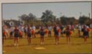
The Performance Group Social at Lunch and Educational programs at the 51 Homecoming Flag Rally.