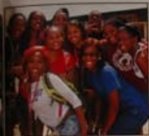
Students enjoying the Daybreak activities.