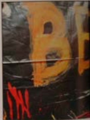
A person dressed as a letter 'B' and 'H' at the 2011 Halloween Parade.