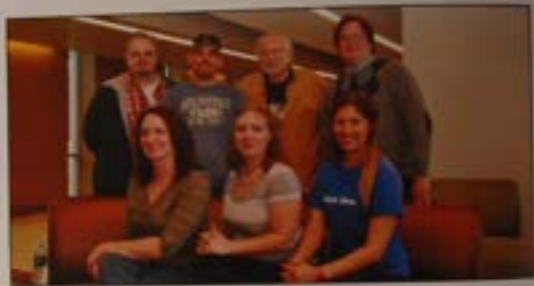
College Democrats and Independents Members