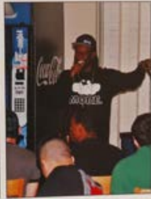
Speaking with guests after dinner service. Yelland's delights the guest list.