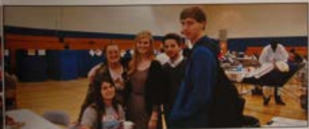
Students interviewing their peers during the Spring 2011 Blood Drive