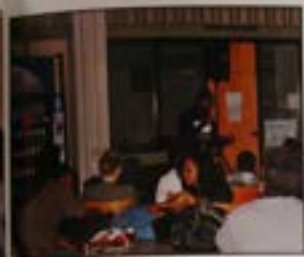
Guests enjoying the food and beverages at Yelland's.