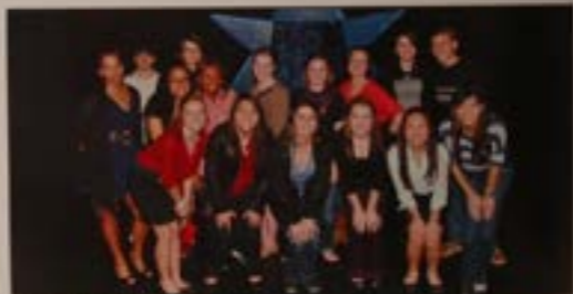
Members of the SGA celebrating another successful Talent Show.