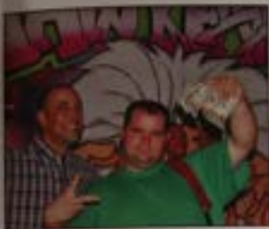
Big stacks of money with the hosts at the Think Fast Game Show.