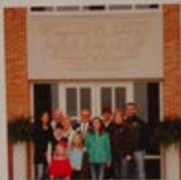
The 2012-13 Homecoming week with the faculty and the dedication of the new Learning Resources Center building at the historic

Here's reliving special Homecoming memories through the photos on the following pages.