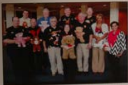
Each year, Connections members collect Teddy Bears to donate to area law enforcement agencies. This year, Connections collected and donated 750 bears.