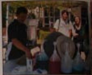
She (left) was working up a head. Her (center) during the event.