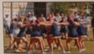
The Performance Group Social at Lunch and Educational programs at the 51 Homecoming Flag Rally.