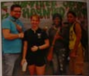
A group of four people dressed in costumes at the 2011 Halloween Parade.