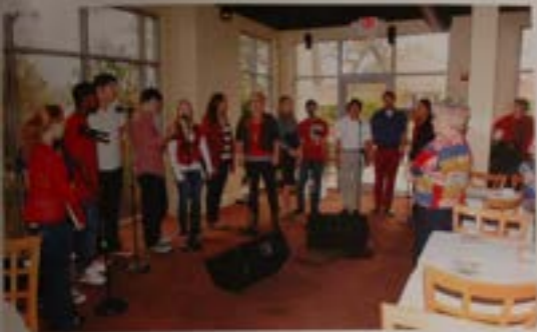
Student musicians performing before the 2012 President Day Parade.