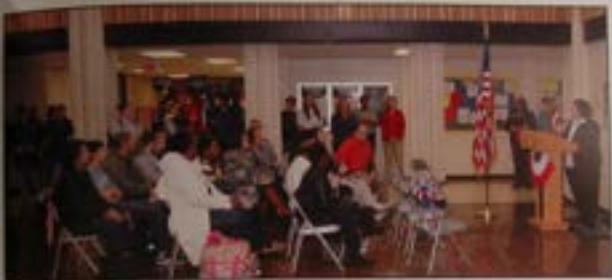
Members of the JROTC students, faculty, and staff gather to celebrate National Day. The occasion commences a field of activities that include a variety of events, including a luncheon and ceremony.