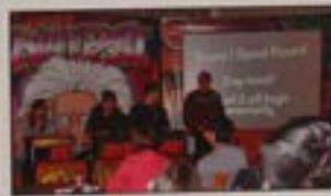
It's amazing how rich you can get during the Think Fast Game Show.