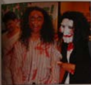
Two of the costumes made for students in the spirit of the school and community.