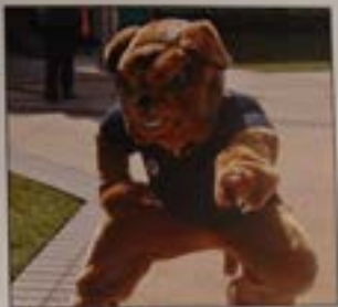
21 The Bulldog mascot is seen in the 2011 Homecoming Parade.