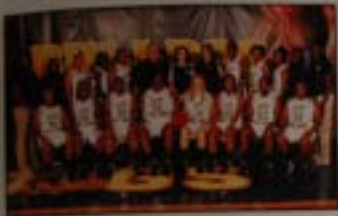
Women's Basketball Coach 407-4402

1. Head Coach - [Name] 2. Assistant Coach - [Name] 3. Assistant Coach - [Name] 4. Assistant Coach - [Name] 5. Assistant Coach - [Name] 6. Assistant Coach - [Name] 7. Assistant Coach - [Name] 8. Assistant Coach - [Name] 9. Assistant Coach - [Name] 10. Assistant Coach - [Name]