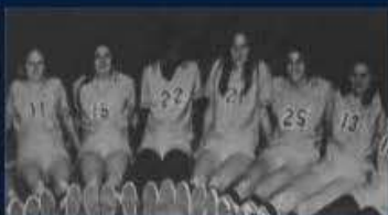
1973 BULLDOGS WOMEN'S BASKETBALL TEAM