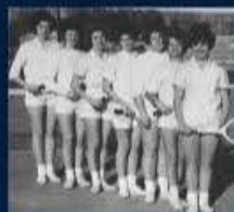
MGCJC CLASS OF 1963