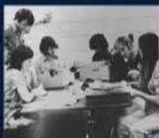
MGCJC CLASS OF 1973