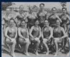
MGCCC CLASS OF 1998