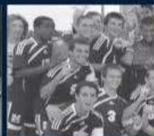
BULLDOGS SOCCER TEAMS 1998 - 2023