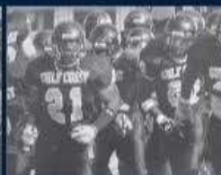
2008 BULLDOGS FOOTBALL TEAM