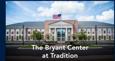
The Bryant Center at Tradition