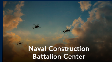
Naval Construction Battalion Center

Sablich Center, Rm 219 500 Fisher St. Biloxi, MS 39534