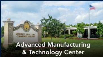
Advanced Manufacturing & Technology Center