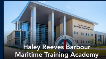
Haley Reeves Barbour Maritime Training Academy

1000 Jerry St. Pe' Hwy. Pascagoula, MS 39568