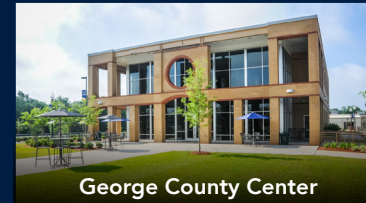
George County Center