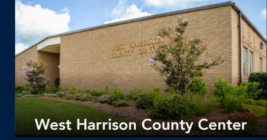
West Harrison County Center

1000 Jerry St. Pe' Hwy. Pascagoula, MS 39568