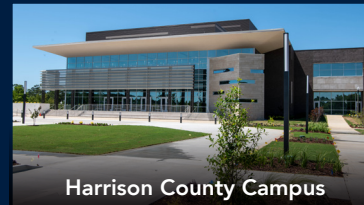
Harrison County Campus