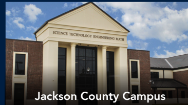
Jackson County Campus